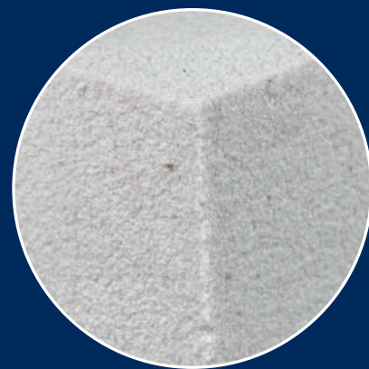
SPECIAL CERAMIC MIXTURE BONDED IN PLASTIC